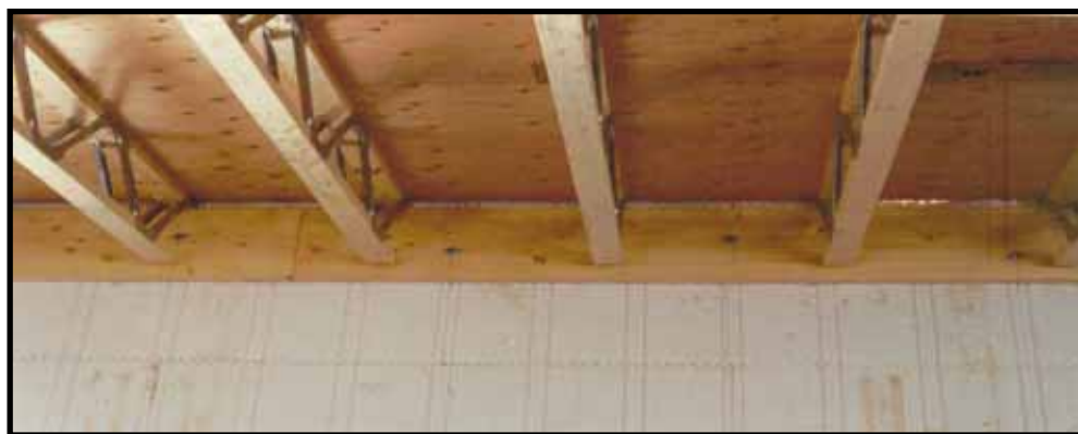
Flange Bolts Spacing As Specified