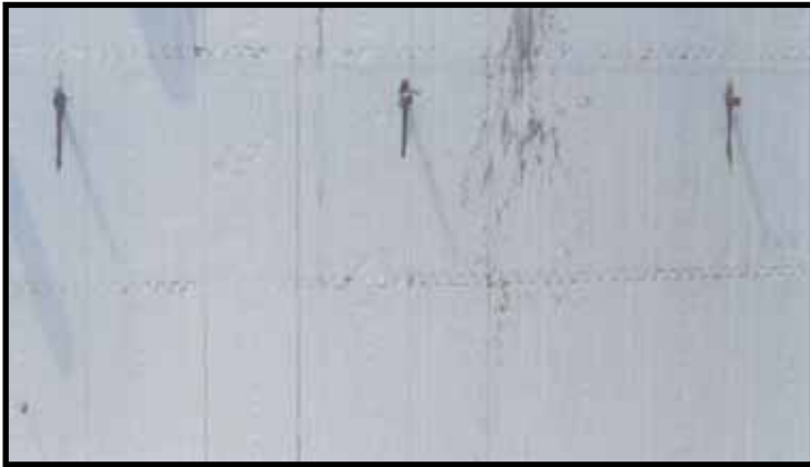
Flange Bolts Installed Prior To Pour