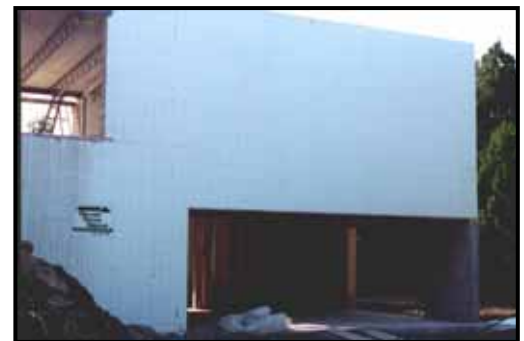
24' Clear Span IntegraSpec® Wall