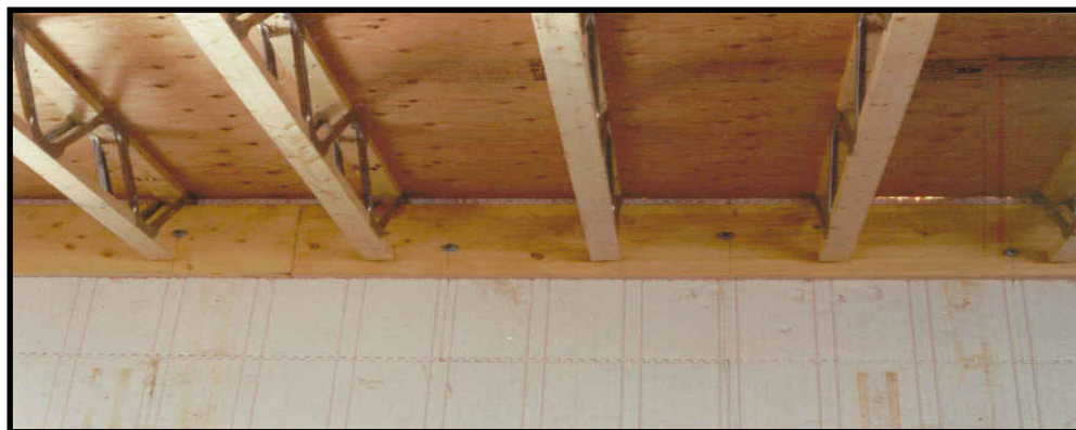
Flange Bolts Spacing As Specified