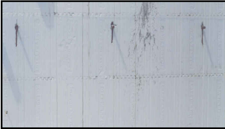
Flange Bolts Installed Prior To Pour