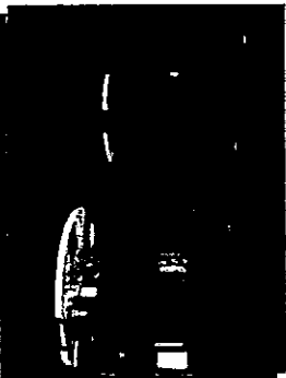
The beautiful interior of the new Elk's Lodge

With the increase in activities at the Lodge, Elk's leaders were worried that noise levels, which in the past posed some problems with a few neighbors, might get worse. As it turns out, having solid concrete walls basically sound proofs the building. So the folks belled up to the bar are not bothered by the noise from the adjacent highway traffic, and when the band inside kicks it into high