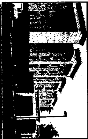
Hampton Inn—Horseheads, NY