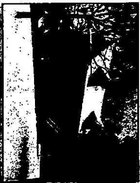
Residential Home—Nichols, NY