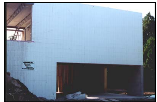
24' Clear Span IntegraSpec wall