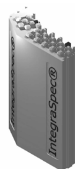
8" Santa Fe IntegraBuck