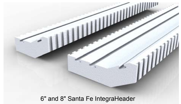
6" and 8" Santa Fe IntegraHeader

“The Santa Fe IntegraBuck Series is a direct result of requests from the field.”